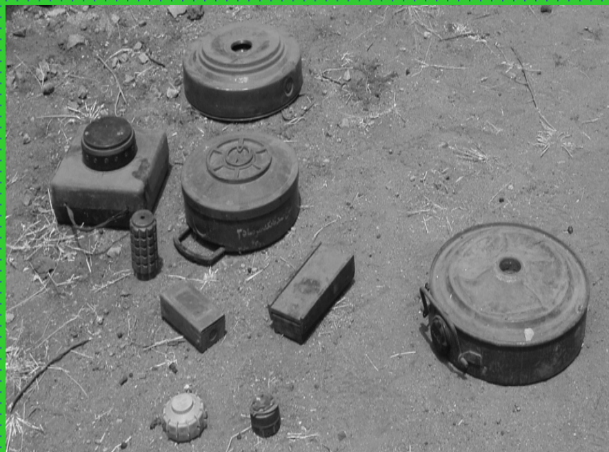
Mines found in South Sudan

No reliable information on extent of landmine contamination