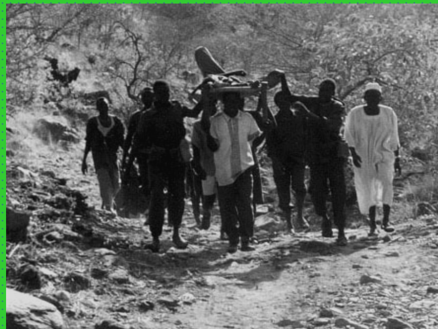
Mine casualty in the Nuba Mountains