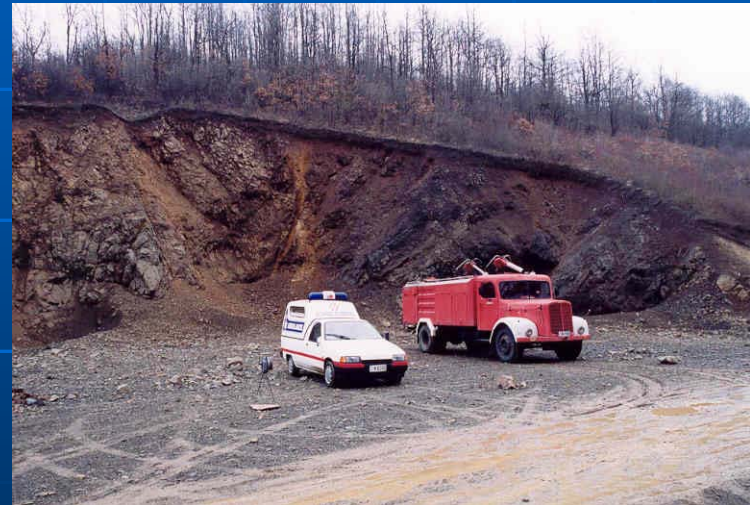
Fire safety and sanitary measures