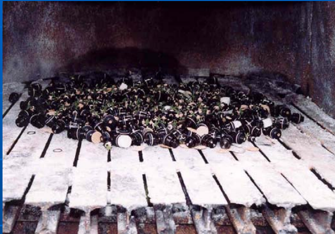
Destruction of fuses