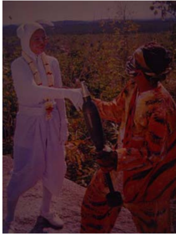
A Scene from an Educational TV spot on Mine Awareness Education