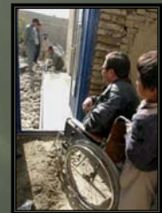
Building under Construction