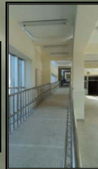
Ghazi High School Ramp to the 2 nd Floor