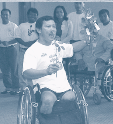
assisting mine victims.