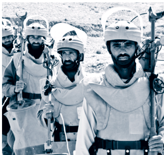
UN High Commissioner for Human Rights, Navi Pillay, will address the 12MSP on its opening day. Above right Afghanistan is one of four States Parties requesting an extension of its mine clearance deadline.