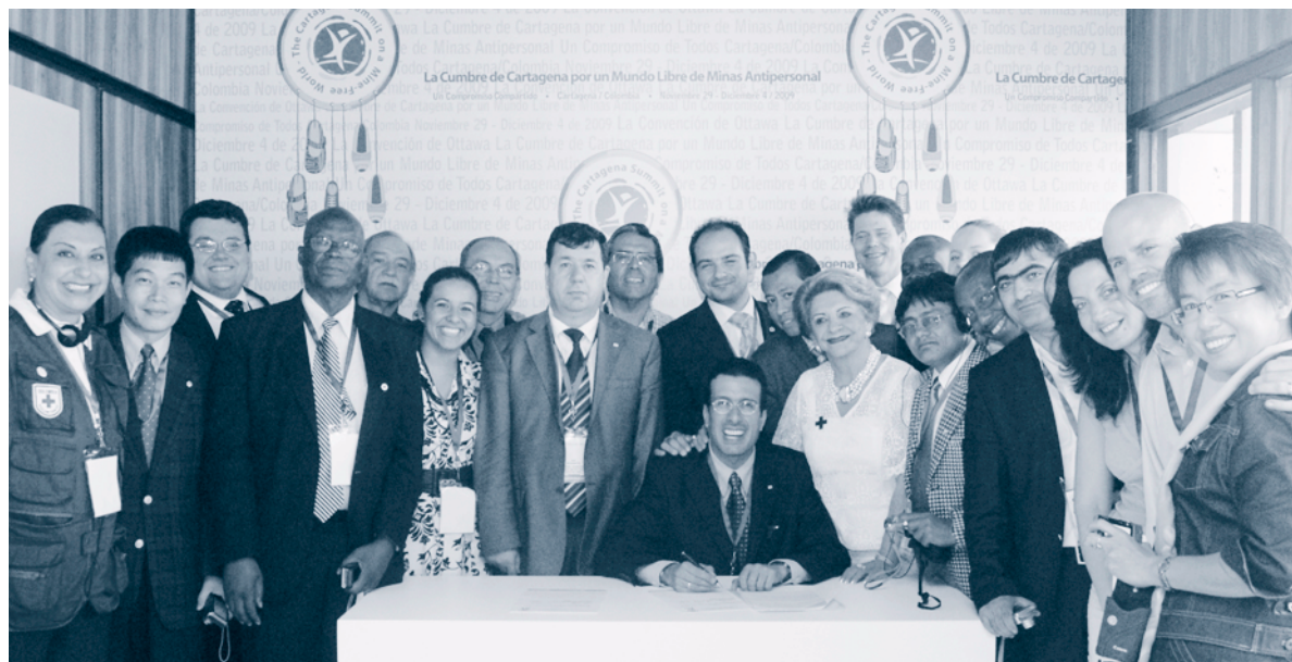
International Federation of the Red Cross and Red Crescent Societies delegates | Cartagena, Colombia | 4 December 2009