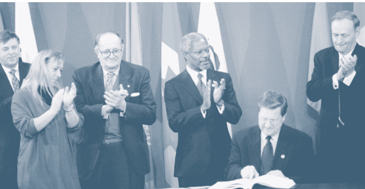
Convention signing ceremony | Ottawa | 3 December 1997

Welcoming also United Nations General Assembly Resolution 51/45 S of 10 December 1996 urging all States to pursue vigorously an effective, legally-binding international agreement to ban the use, stockpiling, production and transfer of anti-personnel landmines,