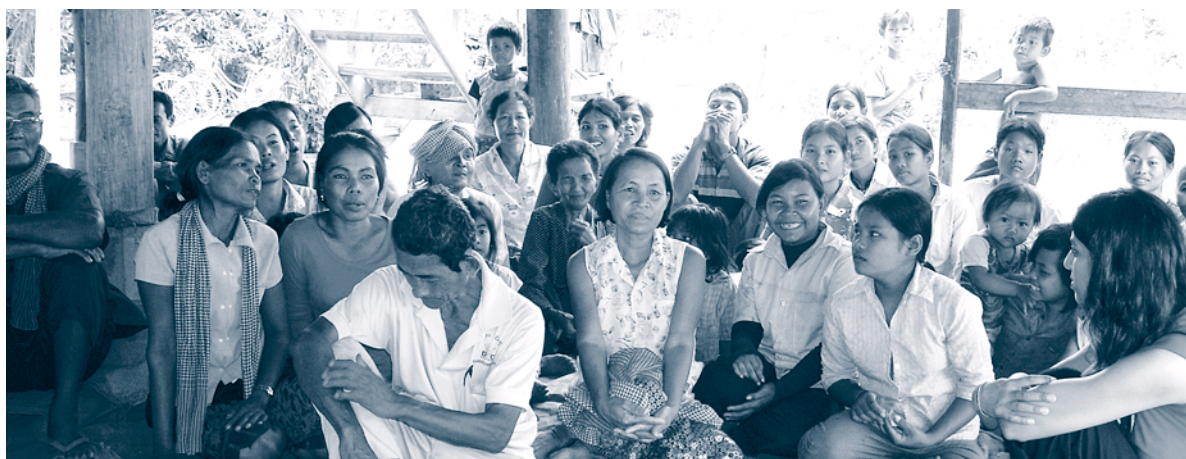
Meeting of villagers in Pursat, Cambodia, to discuss disability and development services.