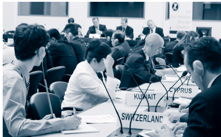
11MSP President H.E. Prak Sokhonn of Cambodia lent his leg for a mine-free world on 1 March 2012. Above right On 3 September 2012, delegates gathered in Geneva to discuss preparations for the 12MSP.