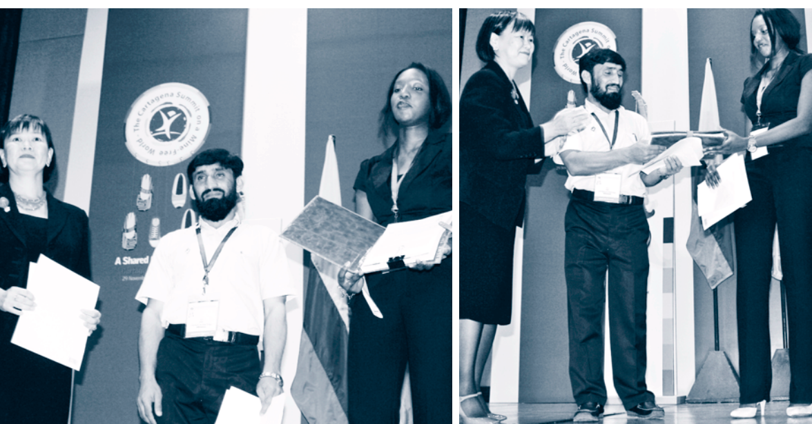
Handover ceremony of the Cartagena Declaration | Cartagena, Colombia | 4 December 2009

Contribute to the Sponsorship Programme thereby permitting widespread representation at meetings of the Convention, particularly by mine-affected developing States Parties.