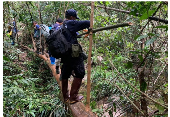
Difficult Terrain in Trat