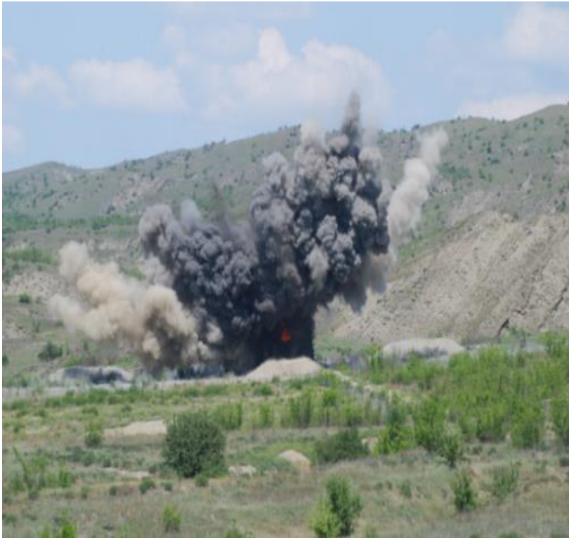
Stockpile Destruction (A4)