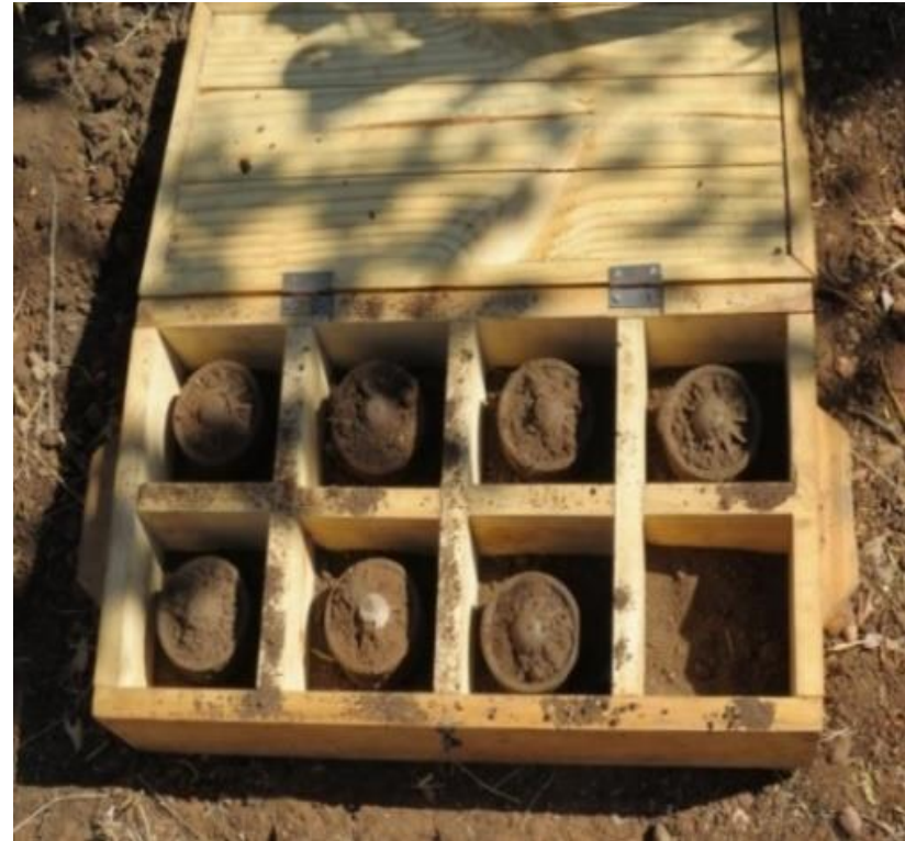
Retained Mined (A3)