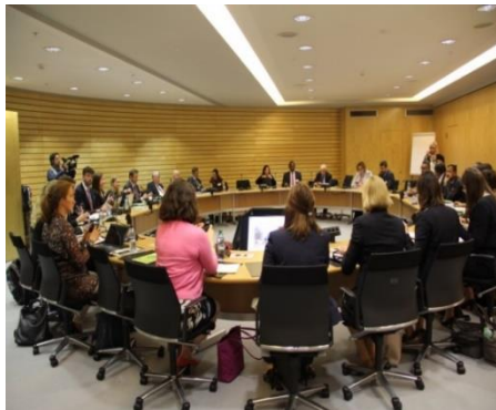
Coop. and Assist.